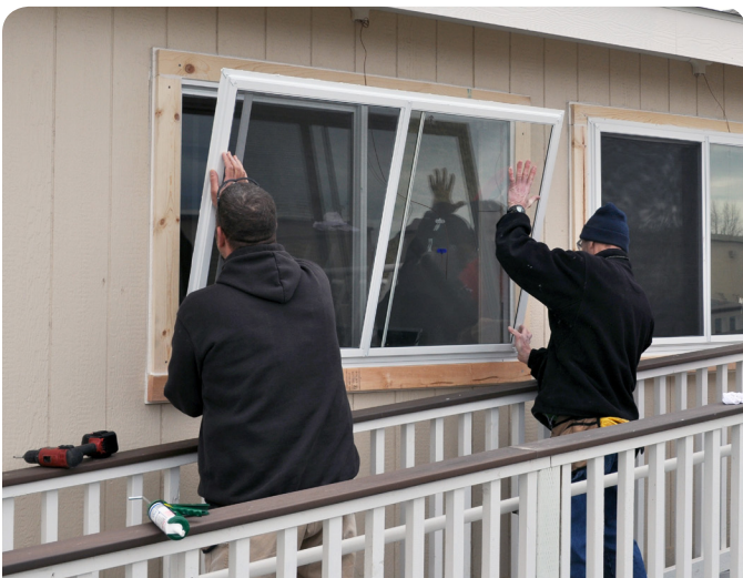
Lab Home results from exterior low-e storm window testing showed up to 10% energy savings on heating and cooling loads.