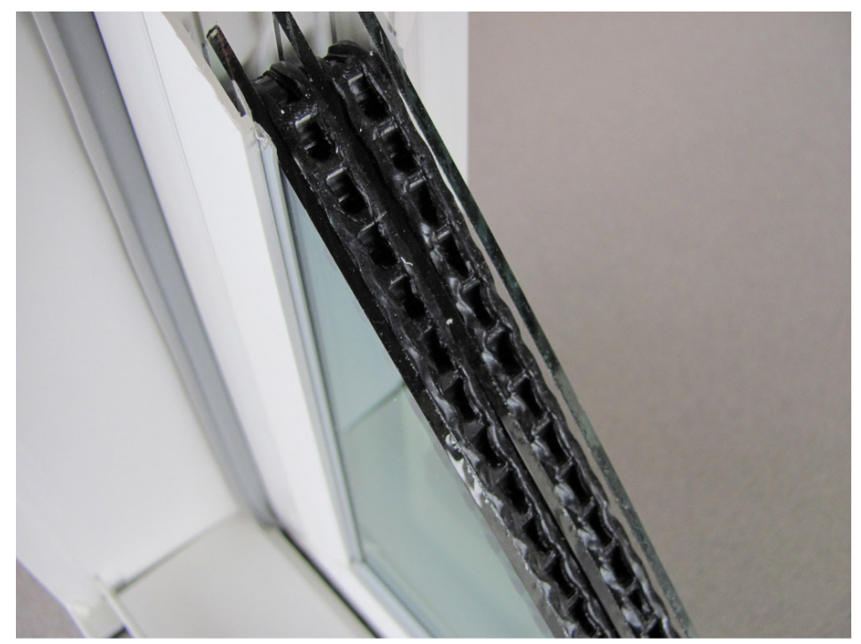
Highly-insulating triple pane window.

Organizations funding work in the PNNL Lab Homes project include the U.S. Department of Energy's Building America and Building Envelope R&D programs, the Bonneville Power Administration, DOE's Office