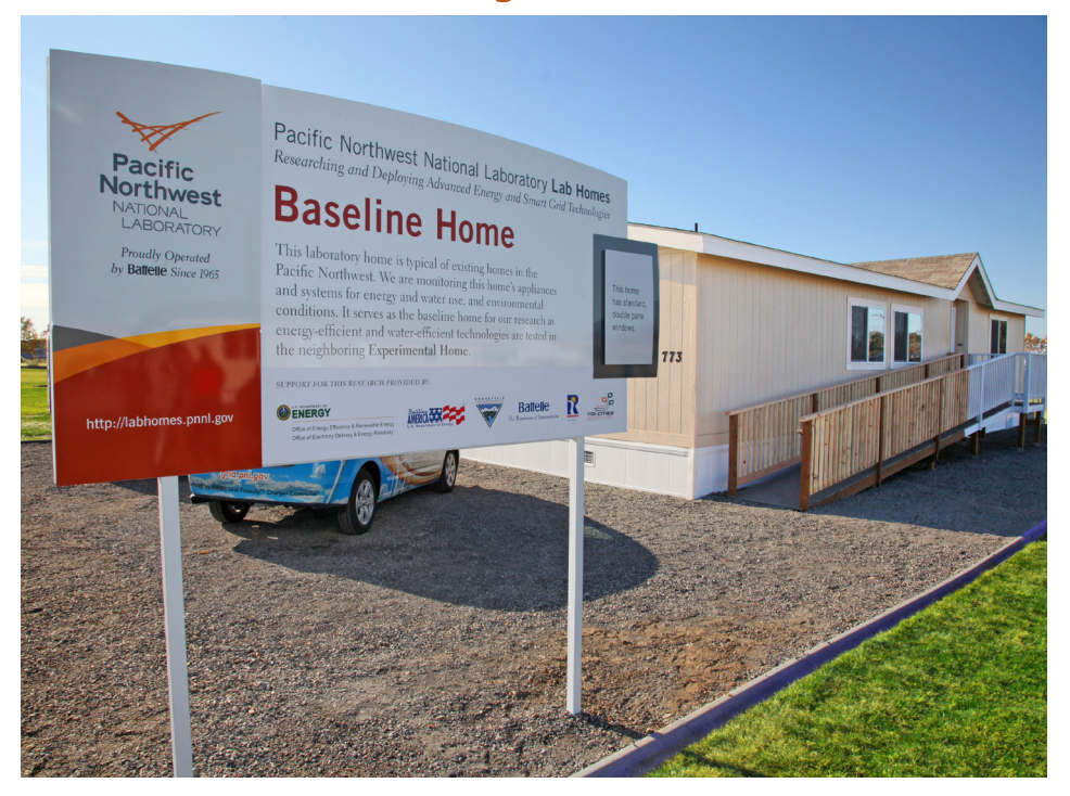
Pacific Northwest National Laboratory's Lab Homes

Residential buildings currently account for approximately 22 percent of the nation's annual energy use. As a result, the adoption of energy-saving technologies could mean substantial savings for the consumer and the nation, and lessen our impact on the environment.